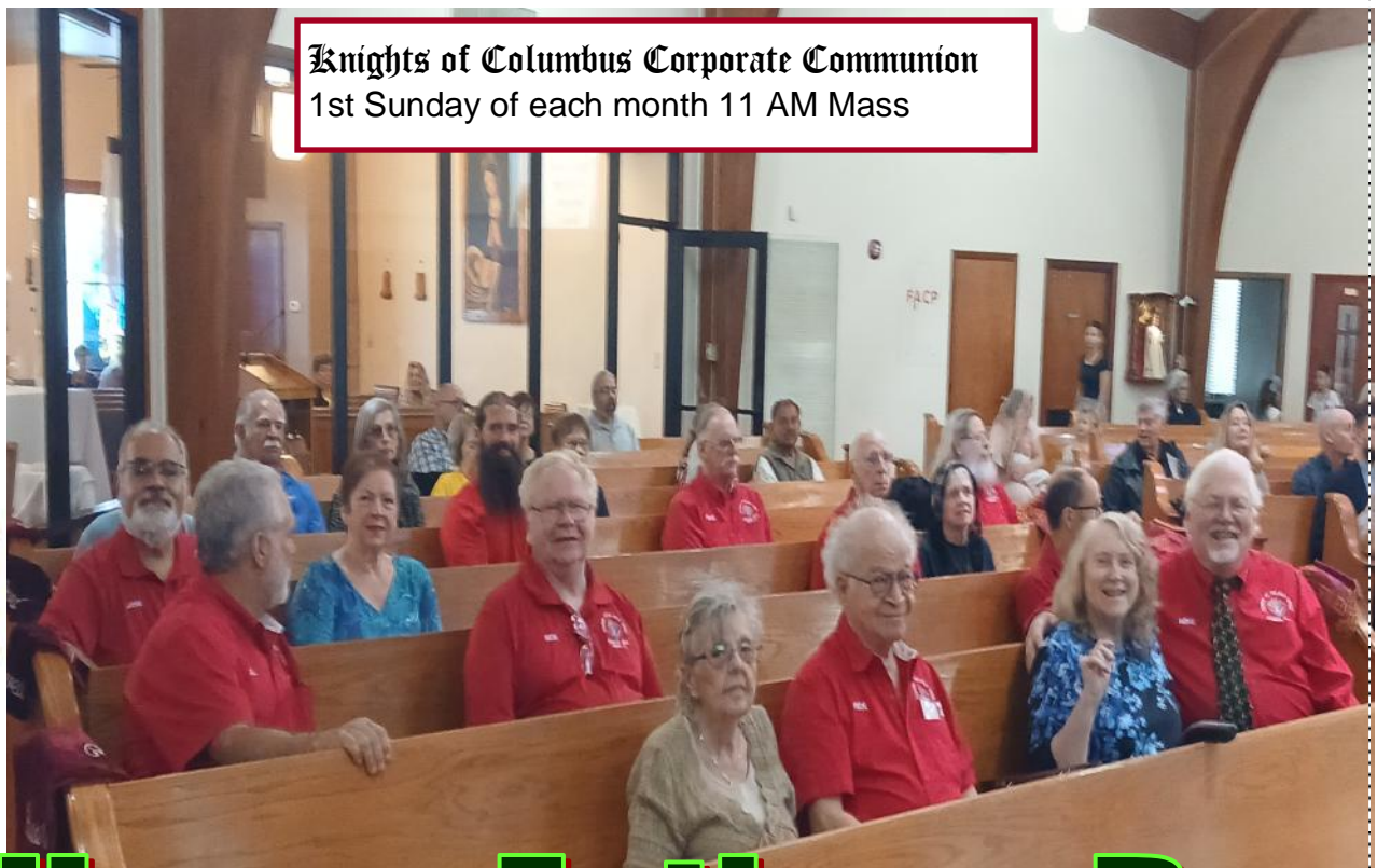
Knights of Columbus Corporate Communion 1st Sunday of each month 11 AM Mass