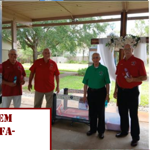
BABY BOTTLE AND BABY ITEM DRIVE. MOTHERS DAY TILL FATHERS DAY.